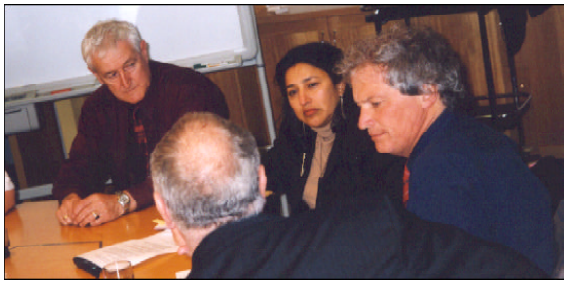
Core Group members of the Mayors Taskforce for Jobs Strategy Meeting at Local Government NZ Boardroom, Wellington, November 2000